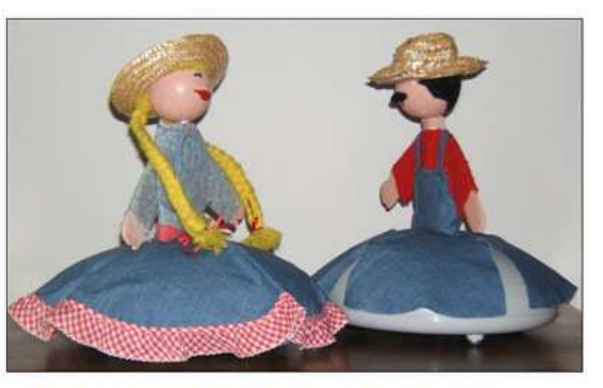
An American square dance version of the Maori project.

Figure 3: The design of Roamer robots can reflect the students cultural interests.