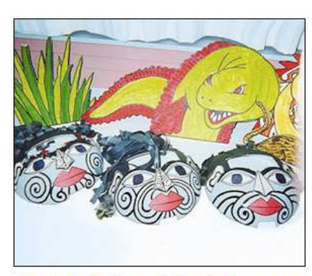
Maori students used Classic Roamer as part of a RPA Project. They created Maori robots programmed to perform their traditional dances.