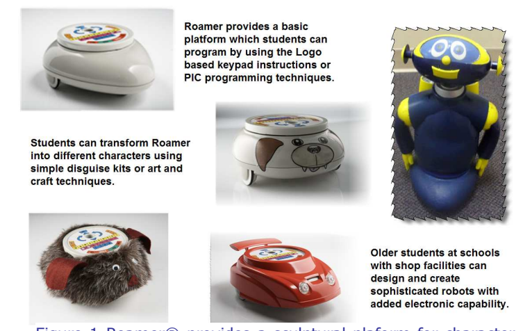
Figure 1 Roamer \ensuremath{\mathbb{R}} provides a sculptural plaform for character creation.

One obvious STEM strand is the design and construction of robot characters (Jones 1991,