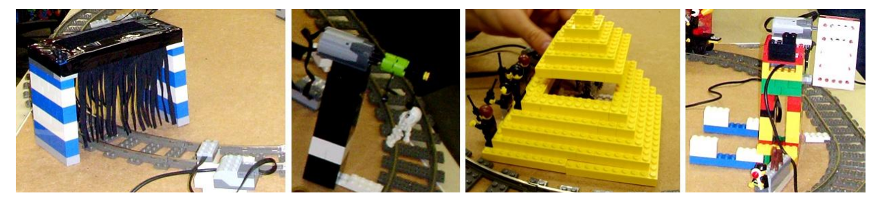
Figure 5. The Spooky castle models: the tunnel, skeleton, jumping pyramid monster, paper ball shower