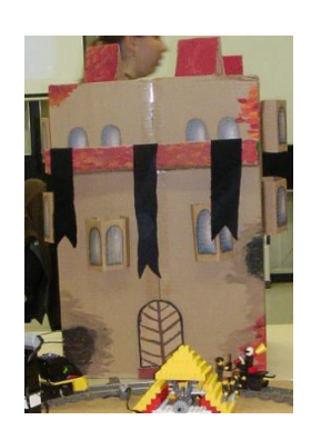
Figure 6. The Spooky castle made of cardboard

We've observed closely the dynamics in group teamwork. The tasks were defined very soon and distributed among the students. Boys were assigned to build and program 2 models, girls made the other 2 models. The models were rebuild and repaired several times by the boys and the girls as well. Mostly girls made the castle prop and recorded the sounds. Whole group cooperated each seminar at assembling and disassembling the project set since we had to move it to another room. At one point when the group was told they need to finish the work and conclude the project they were in need of better work management. In this situation a dominant girl took the leading role and told everyone what needs to be done. After this the group quickly finished everything and prepared the project for exhibition.